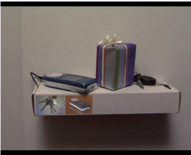
Figure 3. Digital reminders transferred to the reminder shelf

home, you literally have to stumble on the objects you are supposed to bring. Moreover, this happens in exactly the right moment: not too early (one hour before leaving home) and not too late (after leaving the house). Such objects can also act as proxy reminders for other objects to be taken - a tennis ball acts as a reminder to pack tennis gear. This has also been noted in [5].