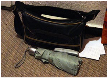
Figure 1. Female participant, Berlin placed handbag and mobile phone at her front door, including objects she thought she would need the next time she left home. The day of the shadowing session, the weather forecast had predicted rain, which induced her to also put umbrella here.

appearance; entertainment; contact & other information; and payment.