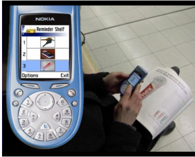
Figure 4. Using a camera phone to capture information to appear in the digital reminder.

needs to bring tooth brush/paste for the next day. By taking a picture of the paste ad ( Figure 4 ), he then creates a reminder on his phone, which then automatically appears on the shelf display when he comes home ( Figure 3 ). When leaving home the next day, picking up his MEs from the shelf, the character catches a glance of the toothpaste reminder and finds his way to the toilet before leaving home.